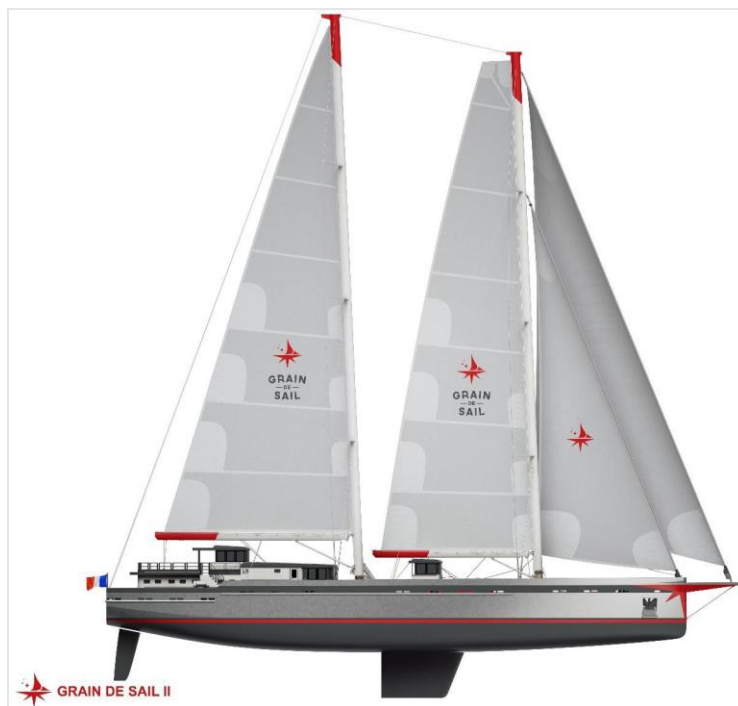
Rendering of Grain de Sail 2

Since November 2020, Grain de Sail operates the world's first modern cargo sailboat to meet international maritime regulations: an eponymous schooner-type vessel of 24 meter and 50 tons of payload capacity. The fast-growing company has this time designed a ship twice as long in collaboration with the naval architecture firm L2Onaval. The overall budget for the build is kept confidential but will remain below the 10M€ mark. Grain de Sail has selected two market leaders to build its next wind-propelled freighter: Piriou will manufacture the hull in its shipyard in Ho Chi Minh City, Vietnam while Lorima will provide the rigging and install it in Lorient, France. The launching of Grain de Sail 2 is planned for end of 2023.